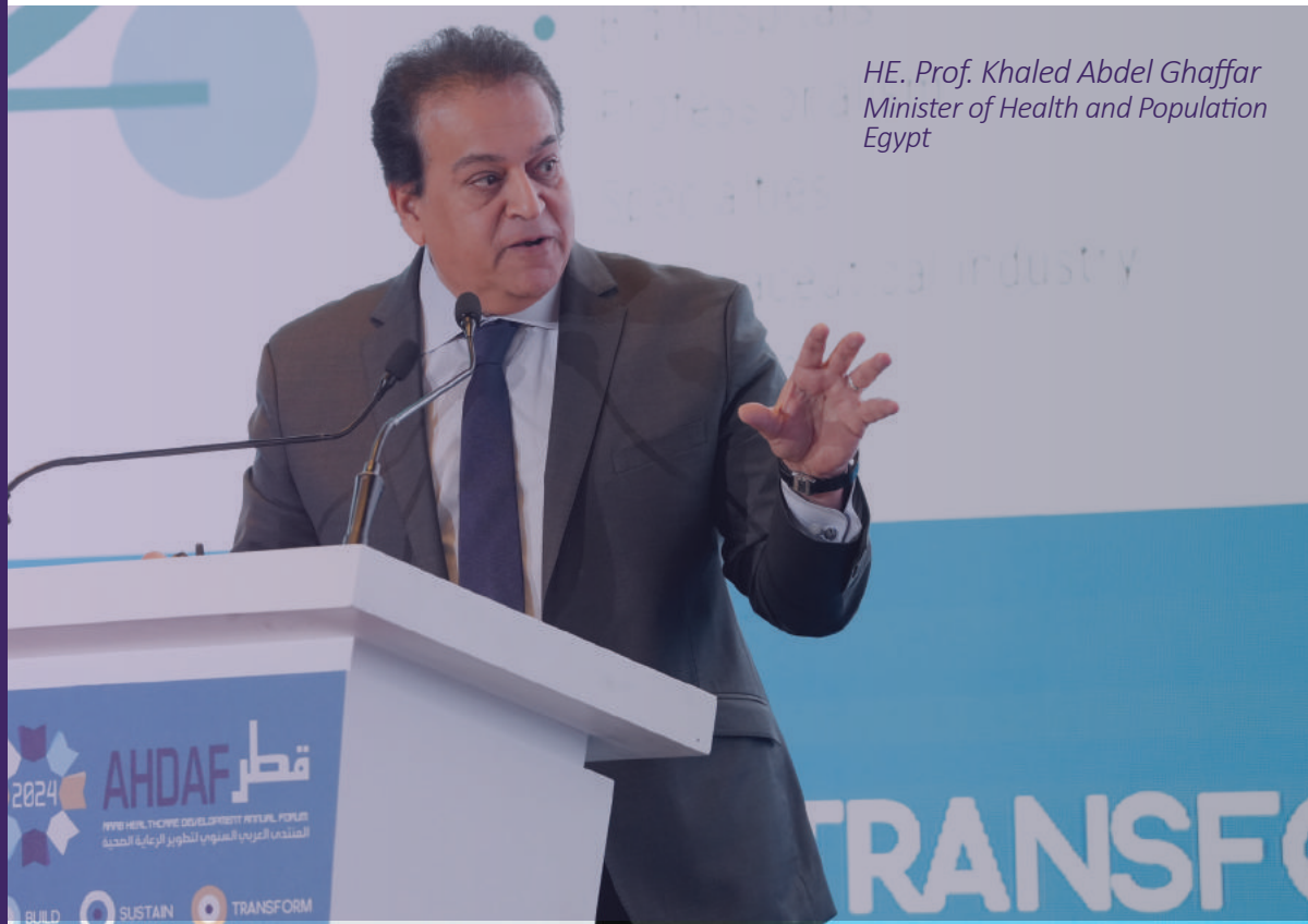
HE. Prof. Khaled Abdel Ghaffar Minister of Health and Population Egypt

This ministerial circle will encourage dialogue between policymakers and stakeholders, bringing lively discussion and debate, reflecting on yesterday's experience and creating Tomorrow's vision.