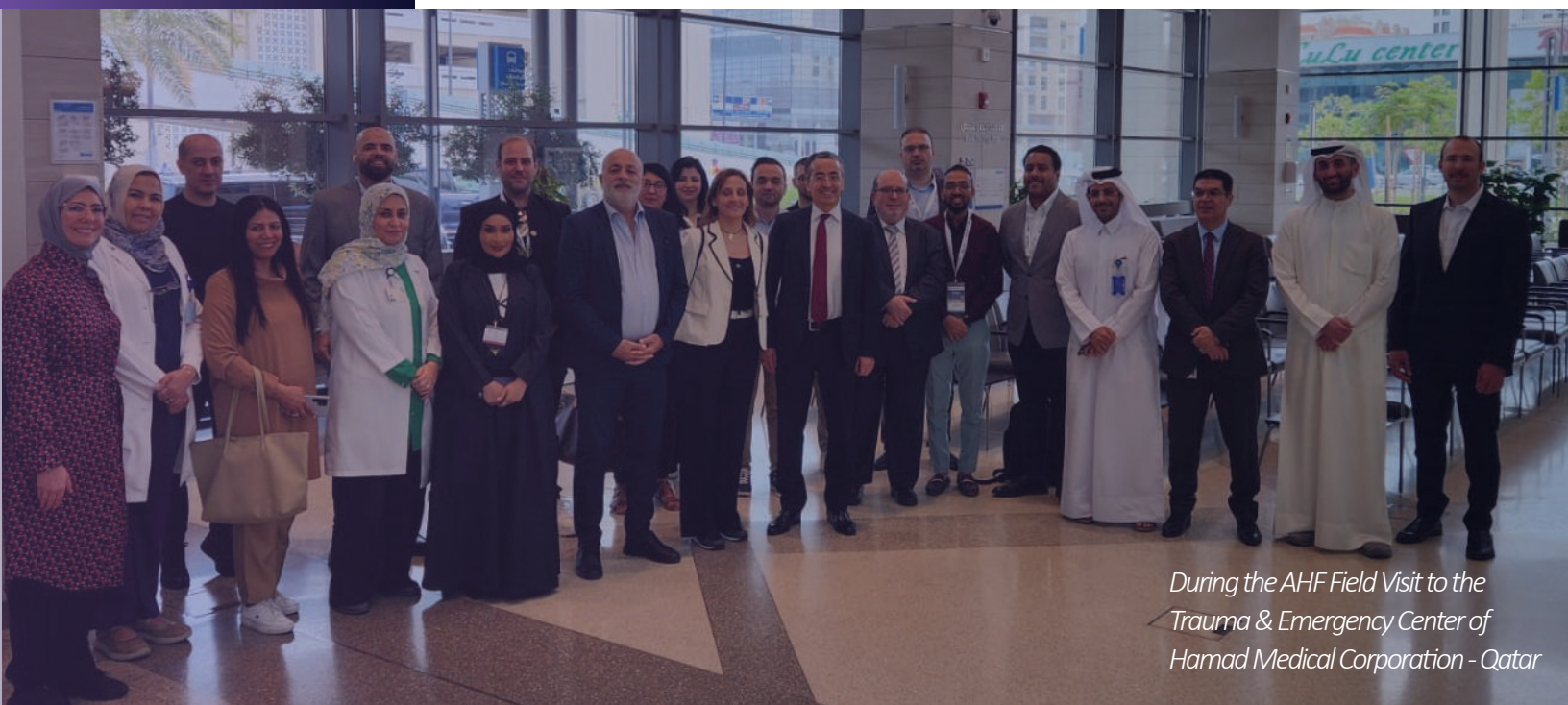
During the AHF Field Visit to the Trauma & Emergency Center of Hamad Medical Corporation - Qatar

As we come together to celebrate "Our Hospitals, Our Pride," let us pause to acknowledge the collective effort, passion, and resilience that have made our hospitals a beacon of hope in our community. Let us honor the past, celebrate the present, and inspire the future as we continue our journey of healing and service.